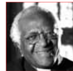
Desmond Mpilo Tutu Archbishop Human Greatness