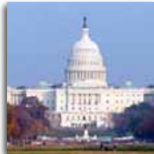
Washington DC USA