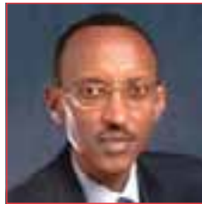
H.E. Paul Kagame President of Rwanda Innovation for Peace