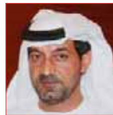
H.H. Sheikh Ahmed bin Saeed Al Maktoum Chairman of Emirates Group Experience Excellence