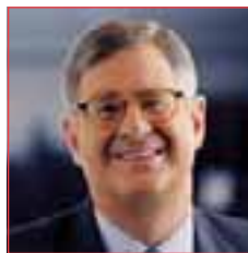
Mr. Samuel J. Palmisano Chairman of Board & CEO of IBM Technology Innovation