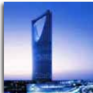
Riyadh Saudi Arabia