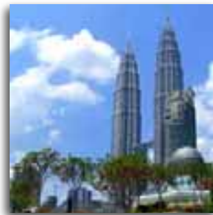
Kuala Lumpur Malaysia