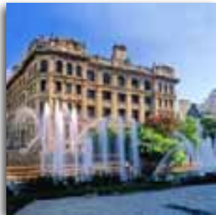
Sao Paulo Brazil