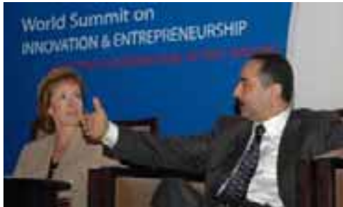
WSIE 2006 VP of Innovation, Kauffman Foundation, Minister of ICT, Tunisia Republic