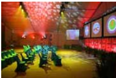
2004 NASA SATS Theatre