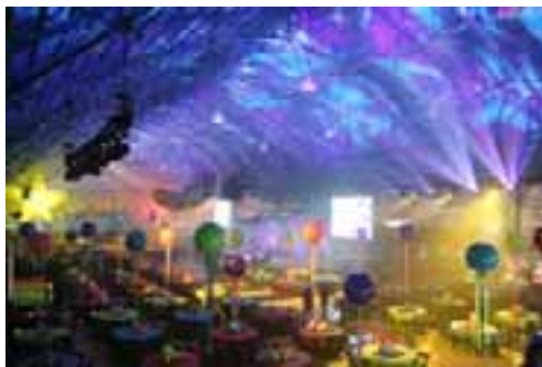
2006 17th Annual Hob Nobble Gobble Fundraiser