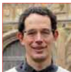
Dr. Neil Turok Founder of the African Institute of Mathematical Sciences Social Innovation